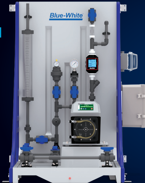
CFPS CHEM-FEED® Plastic Skid System

Choose the SKID SYSTEM Capabilities Your Application Requires: