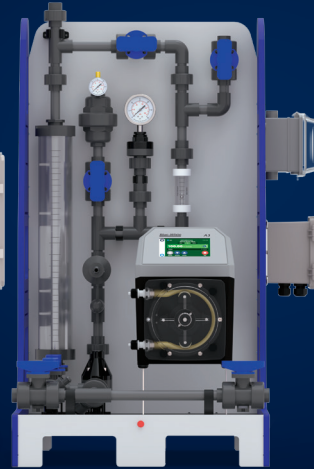
CFCS CHEM-FEED® Compact Skid System