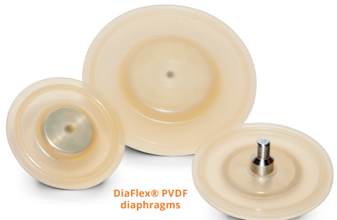
DiaFlex® PVDF diaphragms

The meticulously engineered CHEM-FEED® CD3 is equipped with Blue-White's exclusive, single layer